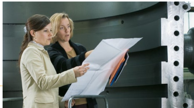
Learn from role models – female engineers in the Femtec.Network

At Femtec, you will meet young female technophiles within a network of over 800 participants and alumnae. Every year, approximately 100 students are added. Furthermore, more than 300 former participants are actively involved in the Femtec.Alumane e.V.