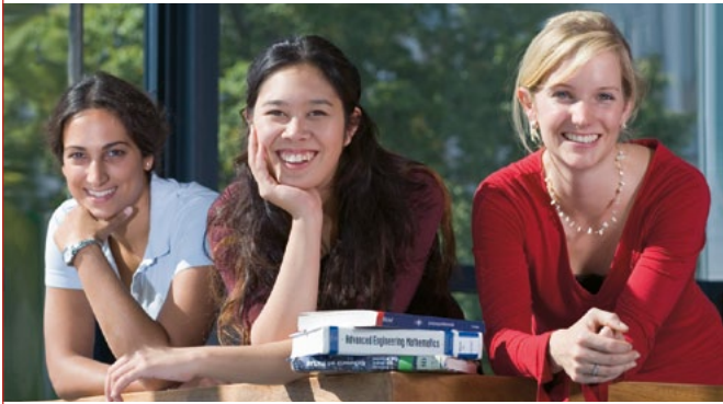
Participants of Femtec's Careerbuilding Programme